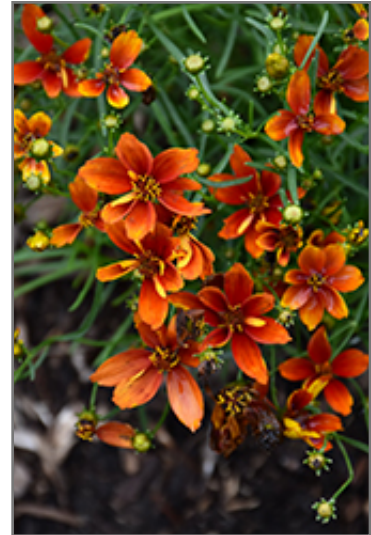
Sizzle And Spice Crazy Cayenne Tickseed flowers

Sizzle And Spice Crazy Cayenne Tickseed is recommended for the following landscape applications;