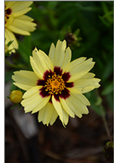
UpTick Cream and Red Tickseed flowers

UpTick Cream and Red Tickseed is recommended for the following landscape applications;