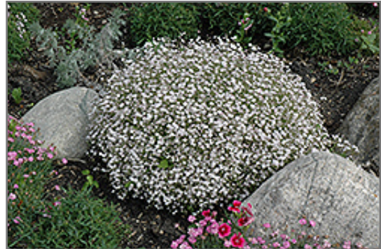
Creeping Baby's Breath in bloom