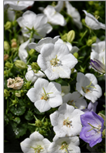
Rapido White Bellflower flowers