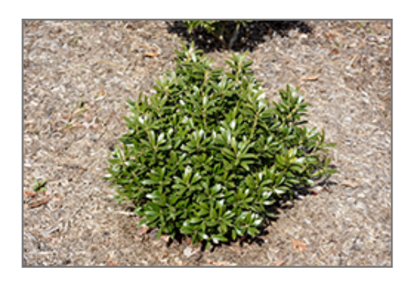
Gem Box Inkberry Holly

Gem Box Inkberry Holly is recommended for the following landscape applications;