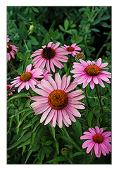
Bravado Coneflower flowers