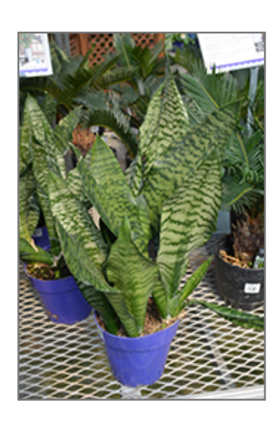
Futura Robusta Snake Plant

When grown indoors, Futura Robusta Snake Plant can be expected to grow to be about 24 inches tall at maturity, with a spread of 12 inches. It grows at a slow rate, and under ideal conditions can be expected to live for approximately 10 years. This houseplant performs well in both bright or indirect sunlight and strong artificial light, and can therefore be situated in almost any well-lit room or location. It is very adaptable to both dry and moist soil, and should do just fine under average home conditions. The surface of the soil shouldn't be allowed to dry out completely, and so you should expect to water this plant once and possibly even twice each week. Be aware that your particular watering schedule may vary depending on its location in the room, the pot size, plant size and other conditions; if in doubt, ask one of our experts in the store for advice. It is not particular as to soil pH, but grows best in sandy soil. Contact the store for specific recommendations on pre-mixed potting soil for this plant.