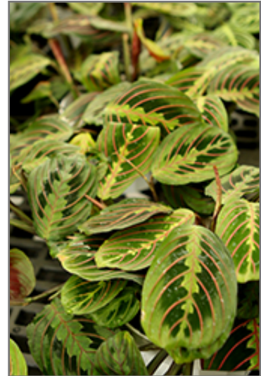
Prayer Plant foliage

-- THIS IS A HOUSEPLANT AND IS NOT MEANT TO SURVIVE THE WINTER OUTDOORS IN OUR CLIMATE --