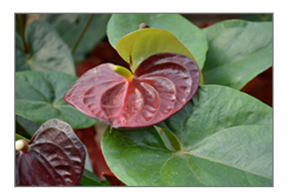
Deco Chocolate Anthurium flowers

When grown indoors, Deco Chocolate Anthurium can be expected to grow to be about 18 inches tall at maturity, with a spread of 12 inches. It grows at a medium rate, and under ideal conditions can be expected to live for approximately 5 years. This houseplant performs well in both bright or indirect sunlight and strong artificial light, and can therefore be situated in almost any well-lit room or location. It does best in average to evenly moist soil, but will not tolerate standing water. The surface of the soil shouldn't be allowed to dry out completely, and so you should expect to water this plant once and possibly even twice each week. Be aware that your particular watering schedule may vary depending on its location in the room, the pot size, plant size and other conditions; if in doubt, ask one of our experts in the store for advice. It is not particular as to soil type, but has a definite preference for acidic soil. Contact the store for specific recommendations on pre-mixed potting soil for this plant. Be warned that parts of this plant are known to be toxic to humans and animals, so special care should be exercised if growing it around children and pets.