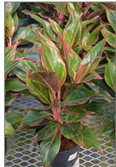
Siam Aurora Chinese Evergreen in full