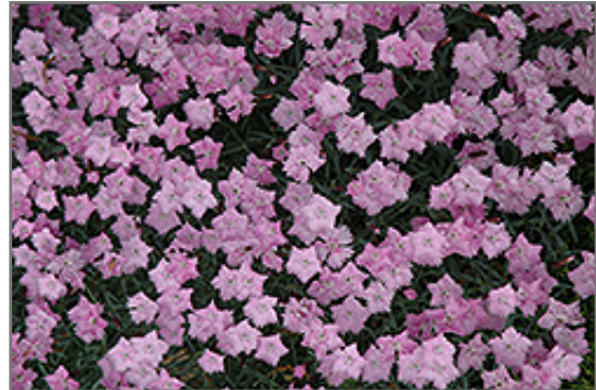
Bath's Pink Pinks in bloom

Bath's Pink Pinks is recommended for the following landscape applications;