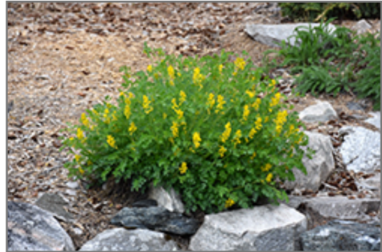
Golden Corydalis in bloom

Golden Corydalis will grow to be about 12 inches tall at maturity, with a spread of 12 inches. Its foliage tends to remain dense right to the ground, not requiring facer plants in front. It grows at a medium rate, and under ideal conditions can be expected to live for approximately 5 years. As an herbaceous perennial, this plant will usually die back to the crown each winter, and will regrow from the base each spring. Be careful not to disturb the crown in late winter when it may not be readily seen!