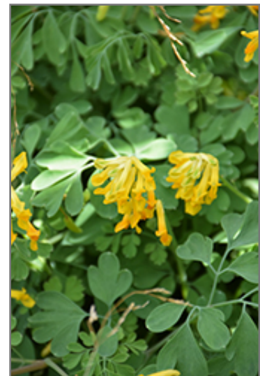
Golden Corydalis flowers