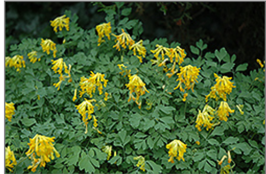
Golden Corydalis in bloom

Golden Corydalis is recommended for the following landscape applications;