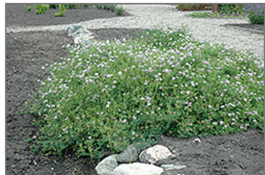
Crown Vetch in bloom