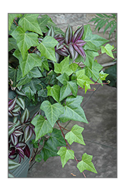
Algerian Ivy foliage

When grown indoors, Algerian Ivy can be expected to grow to be about 10 feet tall at maturity, with a spread of 3 feet. It grows at a fast rate, and under ideal conditions can be expected to live for approximately 30 years. This houseplant performs well in both bright or indirect sunlight and strong artificial light, and can therefore be situated in almost any well-lit room or location. It is very adaptable to both dry and moist soil, and should do just fine under average home conditions. The surface of the soil shouldn't be allowed to dry out completely, and so you should expect to water this plant once and possibly even twice each week. Be aware that your particular watering schedule may vary depending on its location in the room, the pot size, plant size and other conditions; if in doubt, ask one of our experts in the store for advice. It is not particular as to soil pH, but grows best in rich soil. Contact the store for specific recommendations on pre-mixed potting soil for this plant. Be warned that parts of this plant are known to be toxic to humans and animals, so special care should be exercised if growing it around children and pets.