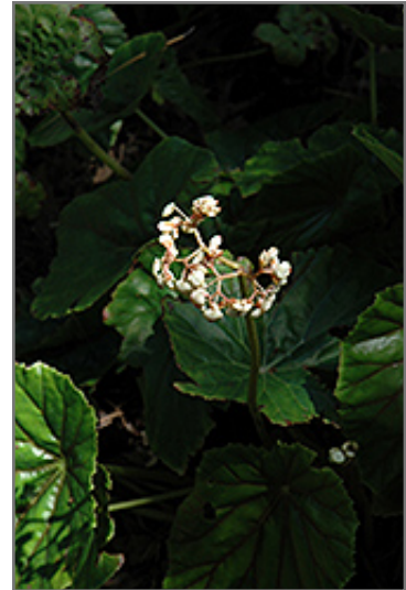
Rubra Lily Pad Begonia flowers

When grown indoors, Rubra Lily Pad Begonia can be expected to grow to be about 24 inches tall at maturity, with a spread of 30 inches. It grows at a medium rate, and under ideal conditions can be expected to live for approximately 20 years. This houseplant performs well in both bright or indirect sunlight and strong artificial light, and can therefore be situated in almost any well-lit room or location. It does best in average to evenly moist soil, but will not tolerate standing water. The surface of the soil shouldn't be allowed to dry out completely, and so you should expect to water this plant once and possibly even twice each week. Be aware that your particular watering schedule may vary depending on its location in the room, the pot size, plant size and other conditions; if in doubt, ask one of our experts in the store for advice. It is particular about its soil conditions, with a strong preference for rich, acidic soil. Contact the store for specific recommendations on pre-mixed potting soil for this plant.