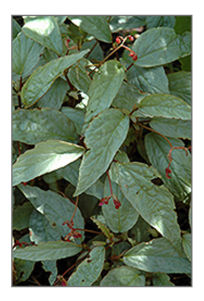
Silver Begonia foliage

When grown indoors, Silver Begonia can be expected to grow to be about 18 inches tall at maturity, with a spread of 24 inches. It grows at a medium rate, and under ideal conditions can be expected to live for approximately 20 years. This houseplant performs well in both bright or indirect sunlight and strong artificial light, and can therefore be situated in almost any well-lit room or location. It does best in average to evenly moist soil, but will not tolerate standing water. The surface of the soil shouldn't be allowed to dry out completely, and so you should expect to water this plant once and possibly even twice each week. Be aware that your particular watering schedule may vary depending on its location in the room, the pot size, plant size and other conditions; if in doubt, ask one of our experts in the store for advice. It is not particular as to soil pH, but grows best in rich soil. Contact the store for specific recommendations on pre-mixed potting soil for this plant.