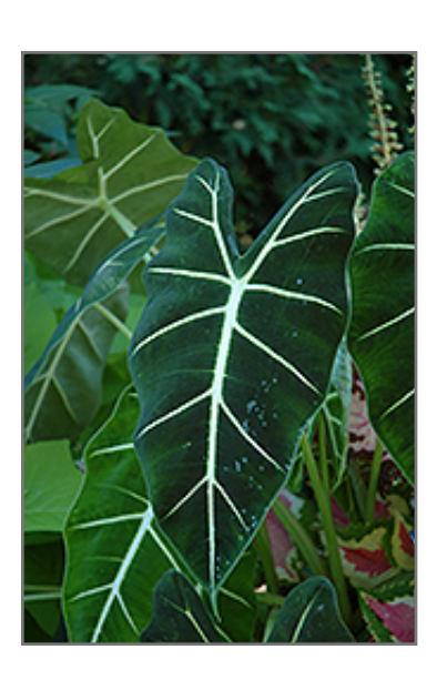
Frydek Elephant's Ear foliage

When grown indoors, Frydek Elephant's Ear can be expected to grow to be about 3 feet tall at maturity, with a spread of 3 feet. It grows at a medium rate, and under ideal conditions can be expected to live for approximately 5 years. This houseplant will do well in a location that gets either direct or indirect sunlight, although it will usually require a more brightly-lit environment than what artificial indoor lighting alone can provide. It is quite adaptable, prefering to grow in average to wet conditions, and will even tolerate some standing water. The surface of the soil should be kept consistently moist all of the time, and you should expect to water this plant two or more times each week, especially if it's growing in a low-humidity environment. Be aware that your particular watering schedule may vary depending on its location in the room, the pot size, plant size and other conditions; if in doubt, ask one of our experts in the store for advice. It is not particular as to soil type or pH; an average potting soil should work just fine. Be warned that parts of this plant are known to be toxic to humans and animals, so special care should be exercised if growing it around children and pets.