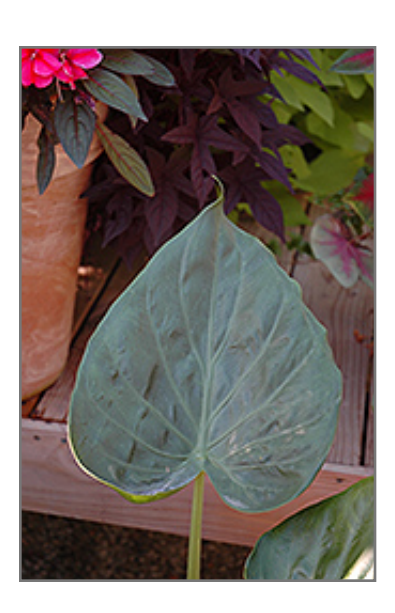
Hooded Dwarf Elephant's Ear foliage

When grown indoors, Hooded Dwarf Elephant's Ear can be expected to grow to be about 3 feet tall at maturity, with a spread of 3 feet. It grows at a medium rate, and under ideal conditions can be expected to live for approximately 5 years. This houseplant should be situated in a location that that gets indirect sunlight at most, although it will usually require a more brightly-lit environment than what artificial indoor lighting alone can provide. It is quite adaptable, prefering to grow in average to wet conditions, and will even tolerate some standing water. The surface of the soil should be kept consistently moist all of the time, and you should expect to water this plant two or more times each week, especially if it's growing in a low-humidity environment. Be aware that your particular watering schedule may vary depending on its location in the room, the pot size, plant size and other conditions; if in doubt, ask one of our experts in the store for advice. It is not particular as to soil type or pH; an average potting soil should work just fine. Be warned that parts of this plant are known to be toxic to humans and animals, so special care should be exercised if growing it around children and pets.