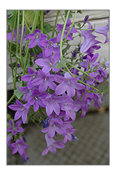
Birch Hybrid Bellflower flowers