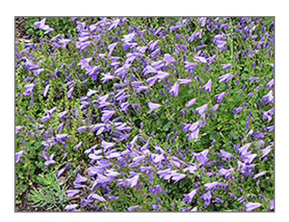
Birch Hybrid Bellflower in bloom

Birch Hybrid Bellflower is recommended for the following landscape applications;