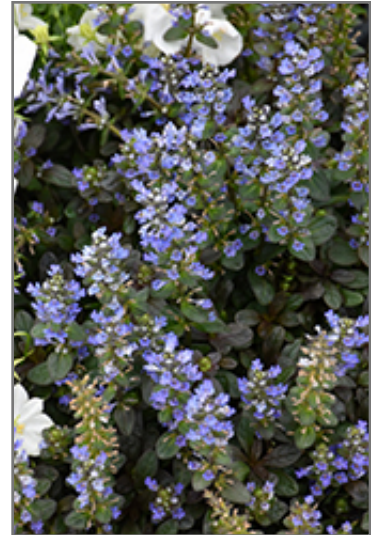
Chocolate Chip Bugleweed flowers

Chocolate Chip Bugleweed is recommended for the following landscape applications;