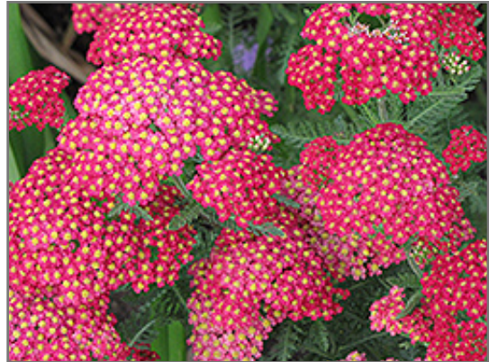
Galaxy Paprika Yarrow flowers

Galaxy Paprika Yarrow is recommended for the following landscape applications;