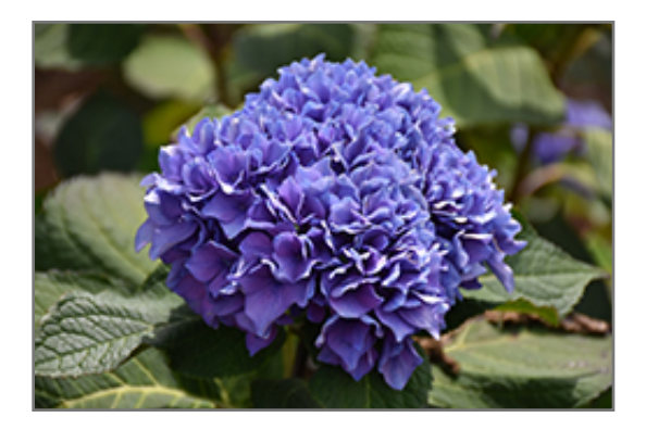
Let's Dance Rhythmic Blue Hydrangea flowers