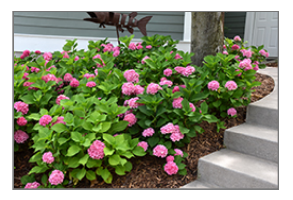
Let's Dance Rhythmic Blue Hydrangea in bloom