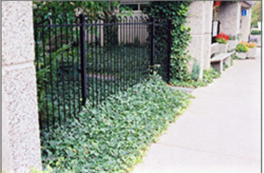
English Ivy