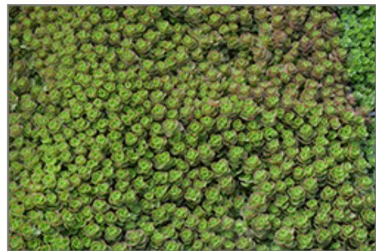
Dragon's Blood Stonecrop foliage