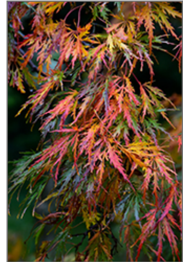
Cutleaf Japanese Maple in fall

Cutleaf Japanese Maple makes a fine choice for the outdoor landscape, but it is also well-suited for use in outdoor pots and containers. Because of its height, it is often used as a 'thriller' in the 'spiller-thriller-filler' container combination; plant it near the center of the pot, surrounded by smaller plants and those that spill over the edges. It is even sizeable enough that it can be grown alone in a suitable container. Note that when grown in a container, it may not perform exactly as indicated on the tag - this is to be expected. Also note that when growing plants in outdoor containers and baskets, they may require more frequent waterings than they would in the yard or garden.