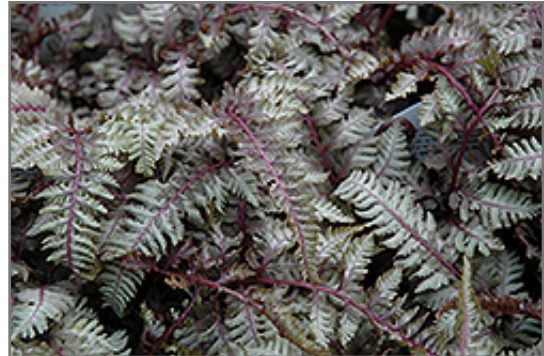
Regal Red Painted Fern foliage