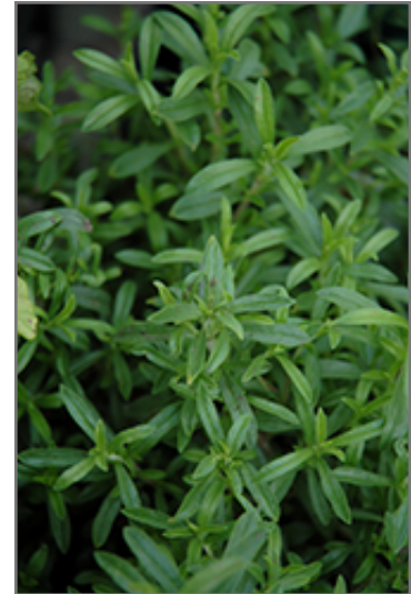
Summer Savory foliage

This plant is quite ornamental as well as edible, and is as much at home in a landscape or flower garden as it is in a designated herb garden. It should only be grown in full sunlight. It is very adaptable to both dry and moist locations, and should do just fine under typical garden conditions. It is not particular as to soil pH, but grows best in poor soils. It is highly tolerant of urban pollution and will even thrive in inner city environments. This species is not originally from North America.