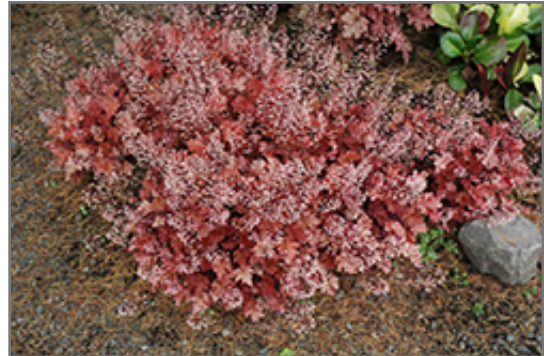
Peach Crisp Coral Bells in bloom

Peach Crisp Coral Bells is recommended for the following landscape applications;