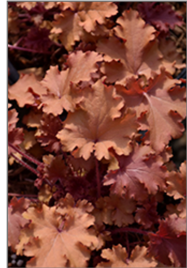
Peach Crisp Coral Bells foliage

Peach Crisp Coral Bells is a fine choice for the garden, but it is also a good selection for planting in outdoor pots and containers. With its upright habit of growth, it is best suited for use as a 'thriller' in the 'spiller-thriller-filler' container combination; plant it near the center of the pot, surrounded by smaller plants and those that spill over the edges. Note that when growing plants in outdoor containers and baskets, they may require more frequent waterings than they would in the yard or garden.