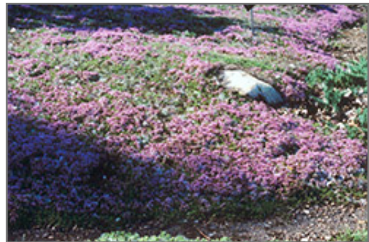
Mother-of-Thyme in bloom