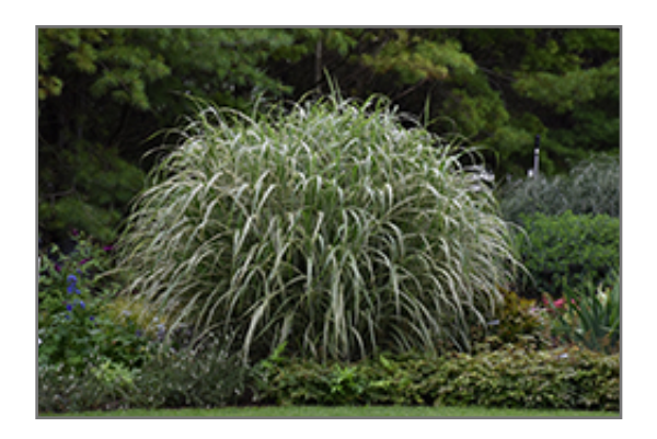
Cosmopolitan Maiden Grass