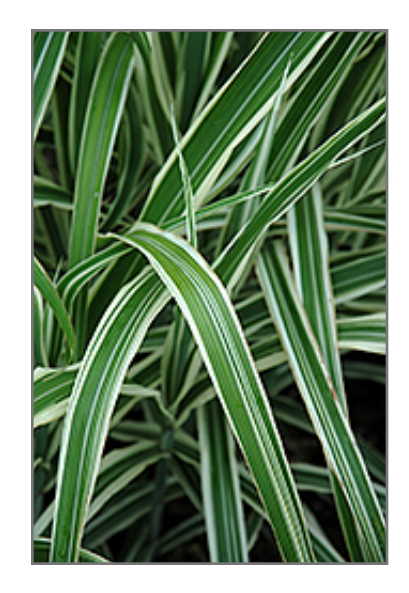
Cosmopolitan Maiden Grass foliage