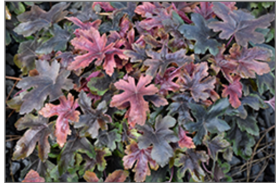
Brass Lantern Foamy Bells

Brass Lantern Foamy Bells is recommended for the following landscape applications;