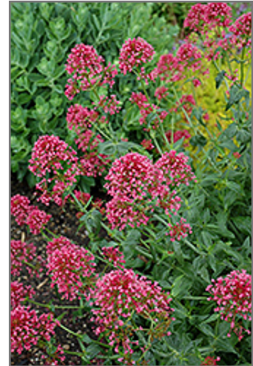
Red Valerian flowers

Red Valerian is recommended for the following landscape applications;