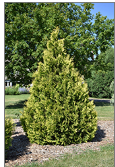
Yellow Ribbon Arborvitae