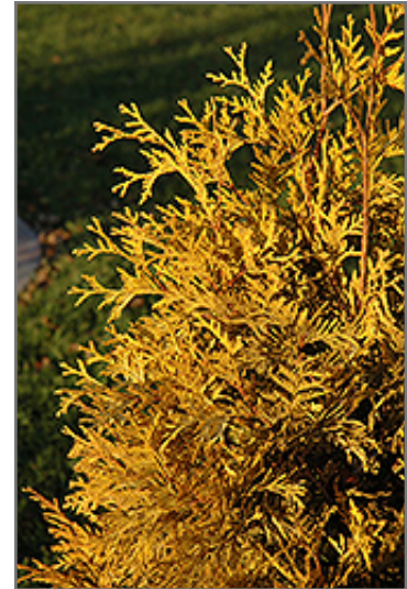
Yellow Ribbon Arborvitae in fall

This shrub does best in full sun to partial shade. It prefers to grow in average to moist conditions, and shouldn't be allowed to dry out. It is not particular as to soil type or pH. It is somewhat tolerant of urban pollution, and will benefit from being planted in a relatively sheltered location. Consider applying a thick mulch around the root zone in winter to protect it in exposed locations or colder microclimates. This is a selection of a native North American species.