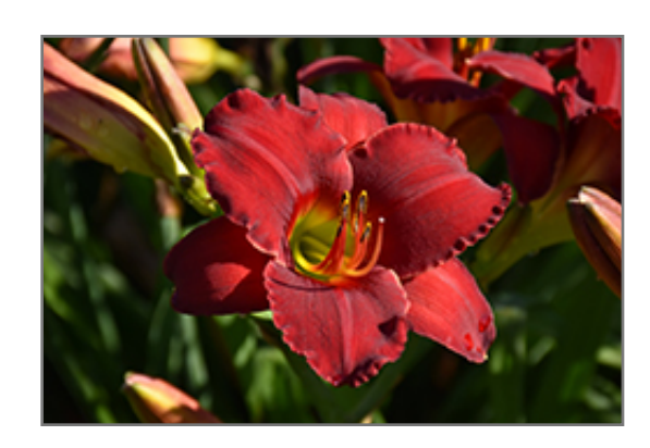
Red Razzmatazz Daylily flowers