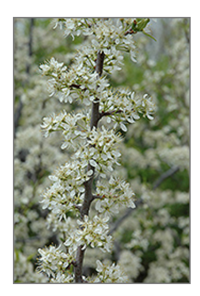
Santa Rosa Plum flowers