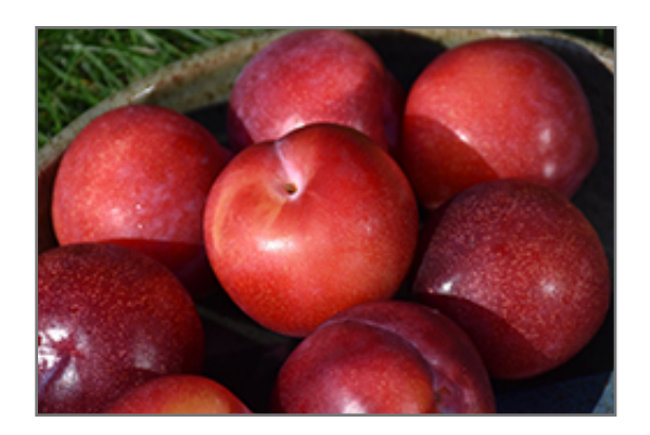
Santa Rosa Plum fruit

Santa Rosa Plum is smothered in stunning clusters of fragrant white flowers along the branches in early spring before the leaves. It has forest green deciduous foliage. The pointy leaves turn yellow in fall. The fruits are showy crimson drupes carried in abundance in late summer. The fruit can be messy if allowed to drop on the lawn or walkways, and may require occasional clean-up.