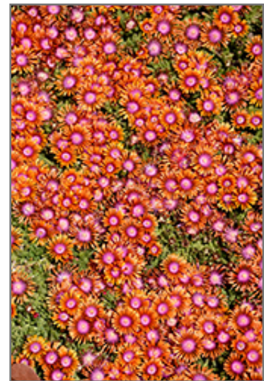
Fire Spinner Ice Plant flowers