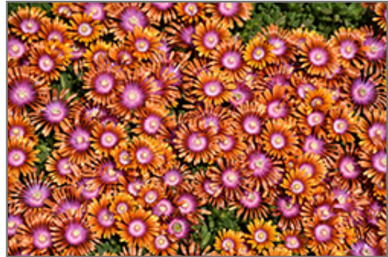
Fire Spinner Ice Plant in bloom

Fire Spinner Ice Plant is recommended for the following landscape applications;