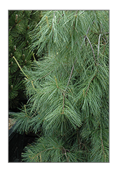
Weeping White Pine foliage