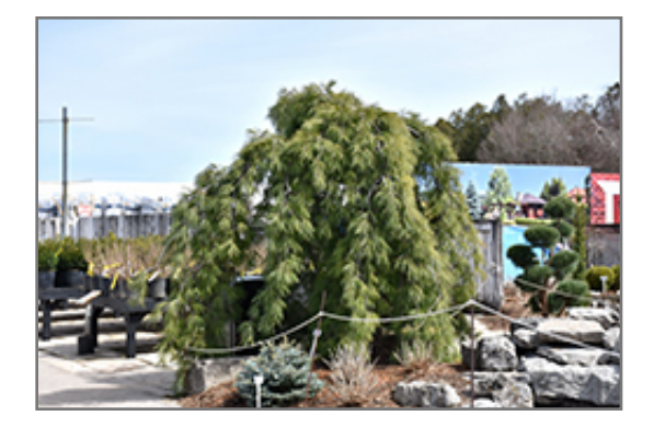
Weeping White Pine

Weeping White Pine is recommended for the following landscape applications;