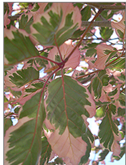
Tricolor Beech foliage